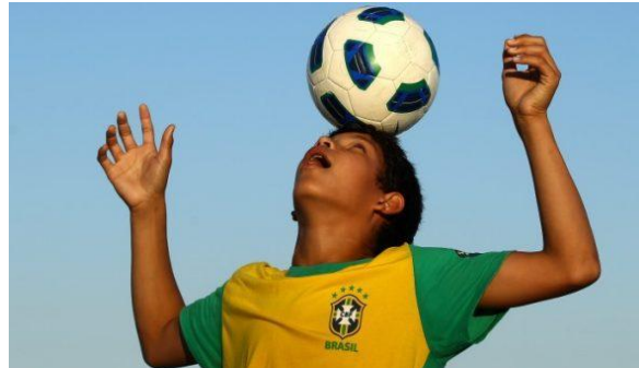
Image 2: “Fiebre de Fútbol: What Soccer means for Latin Americans”