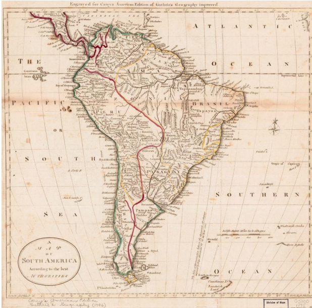
Image 3: Carey, Mathew, and William Guthrie. A map of South America: according to the best authorities. [Philadelphia: Mathew Carey, 1796]

WE December 14, 2022 - Final Assignment - Reflection Letter Due - 11:59PM