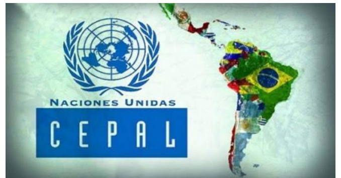
Image 4: ECLAC - UN (Economic Commission for Latin America & Caribbean)